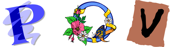
POINT OF VIEW

If your doctor's prescribed an anti-depressant, it's important to take it as directed. It takes about six weeks to feel the benefits, although the side effects could kick in a lot sooner.